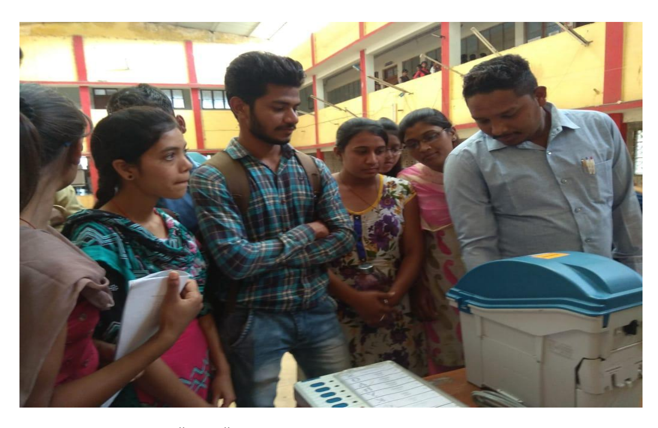
SVEEP-Voter Awareness Rally in college