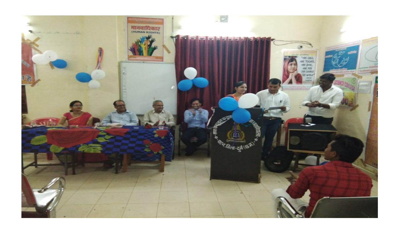
Farewell Botany Deptt.-Apr 2019