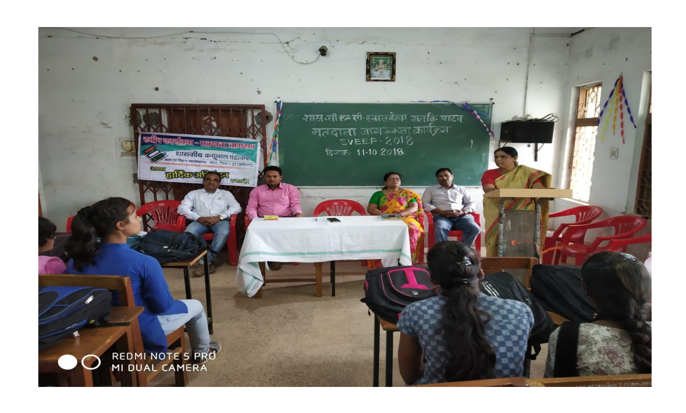
SVEEP-Voter Awareness OATH Taking in college