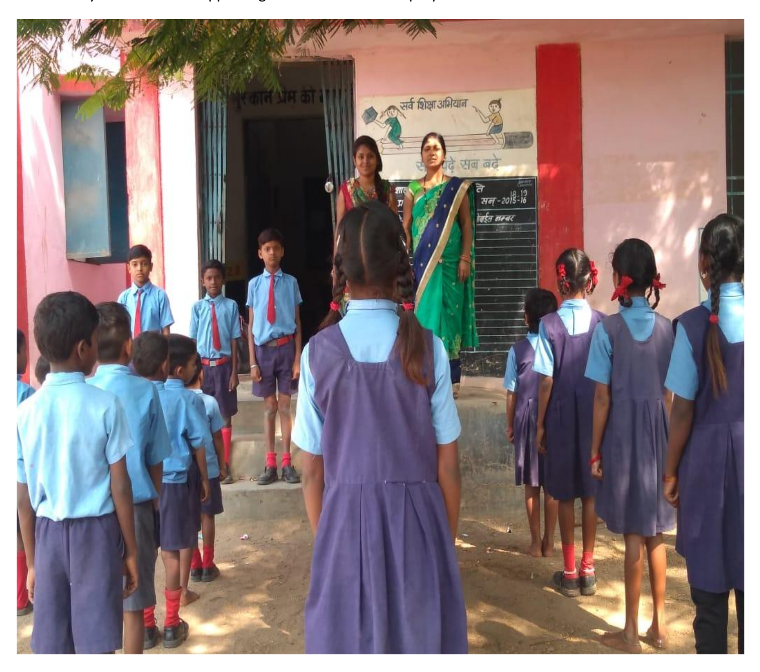
Vidyadan student is appearing at the time of school prayer