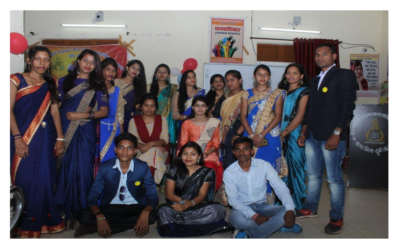
Welcome program in Sociology Department Apr 2019