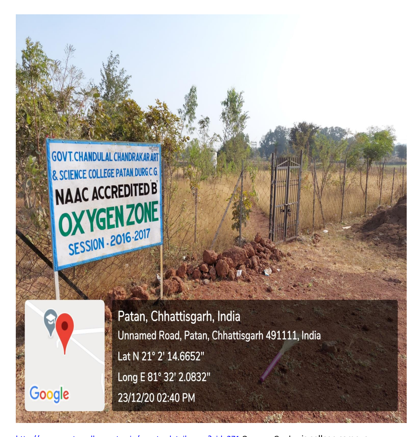
http://www.govtcccollegepatan.in/events_details.aspx?eid=271 Oxyzone Garden is college campus.