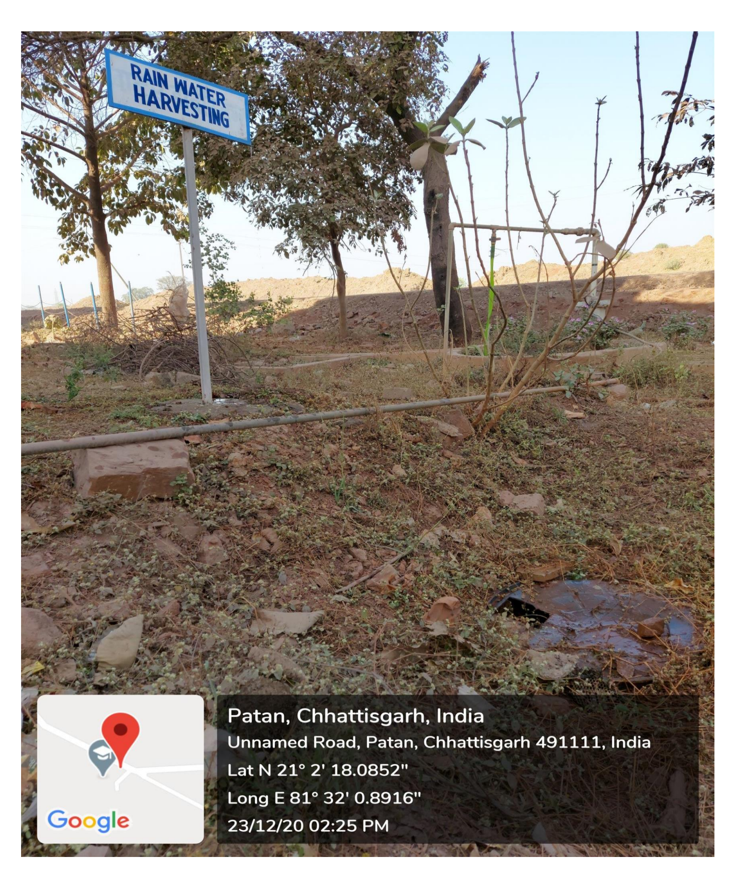
http://www.govtcccollegepatan.in/events_details.aspx?eid=268 Above-Rain Water Harvesting (2)