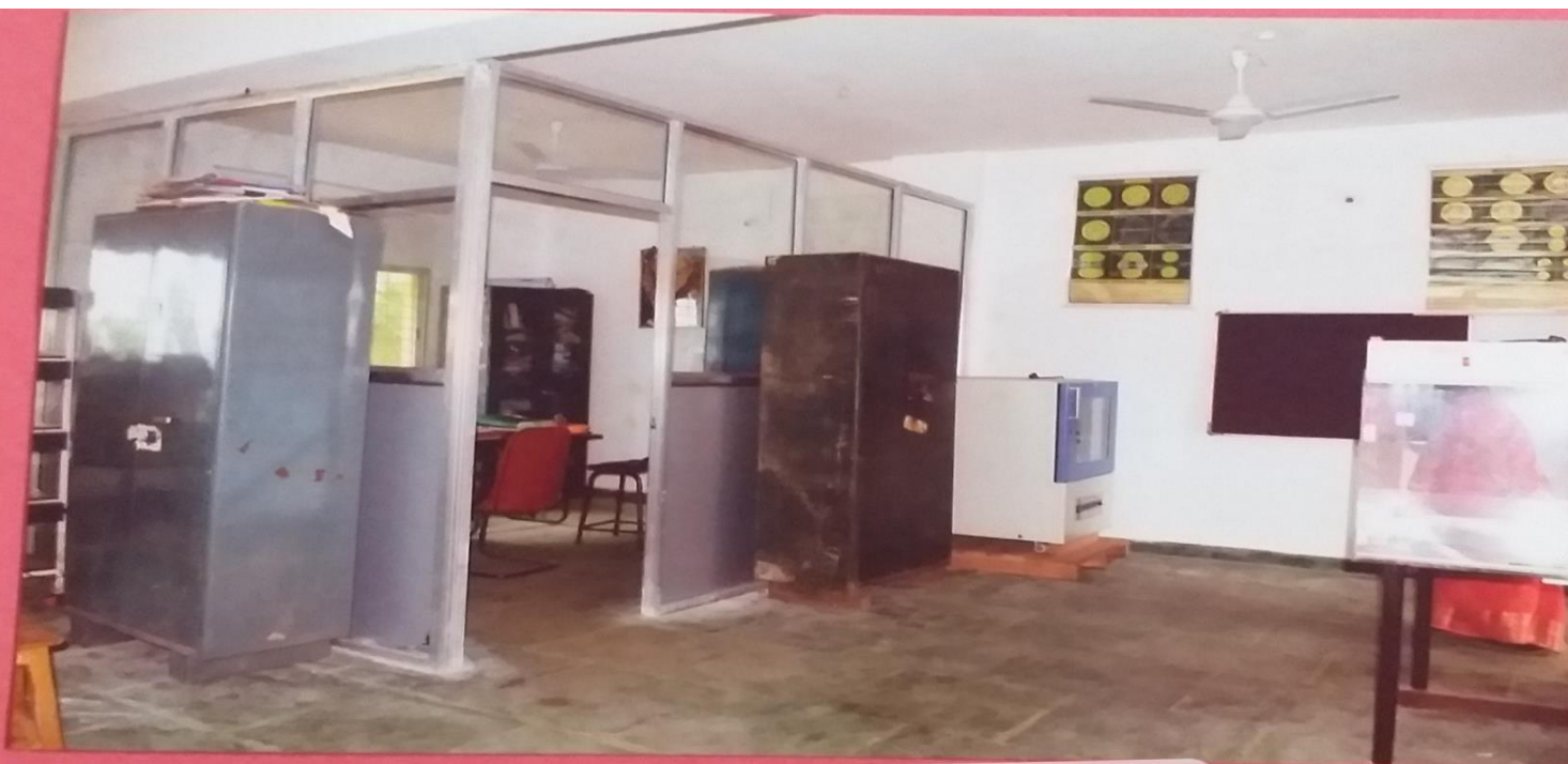
new botany lab