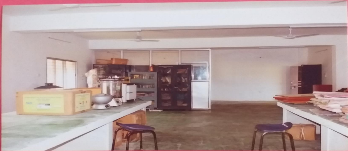
new zoology lab