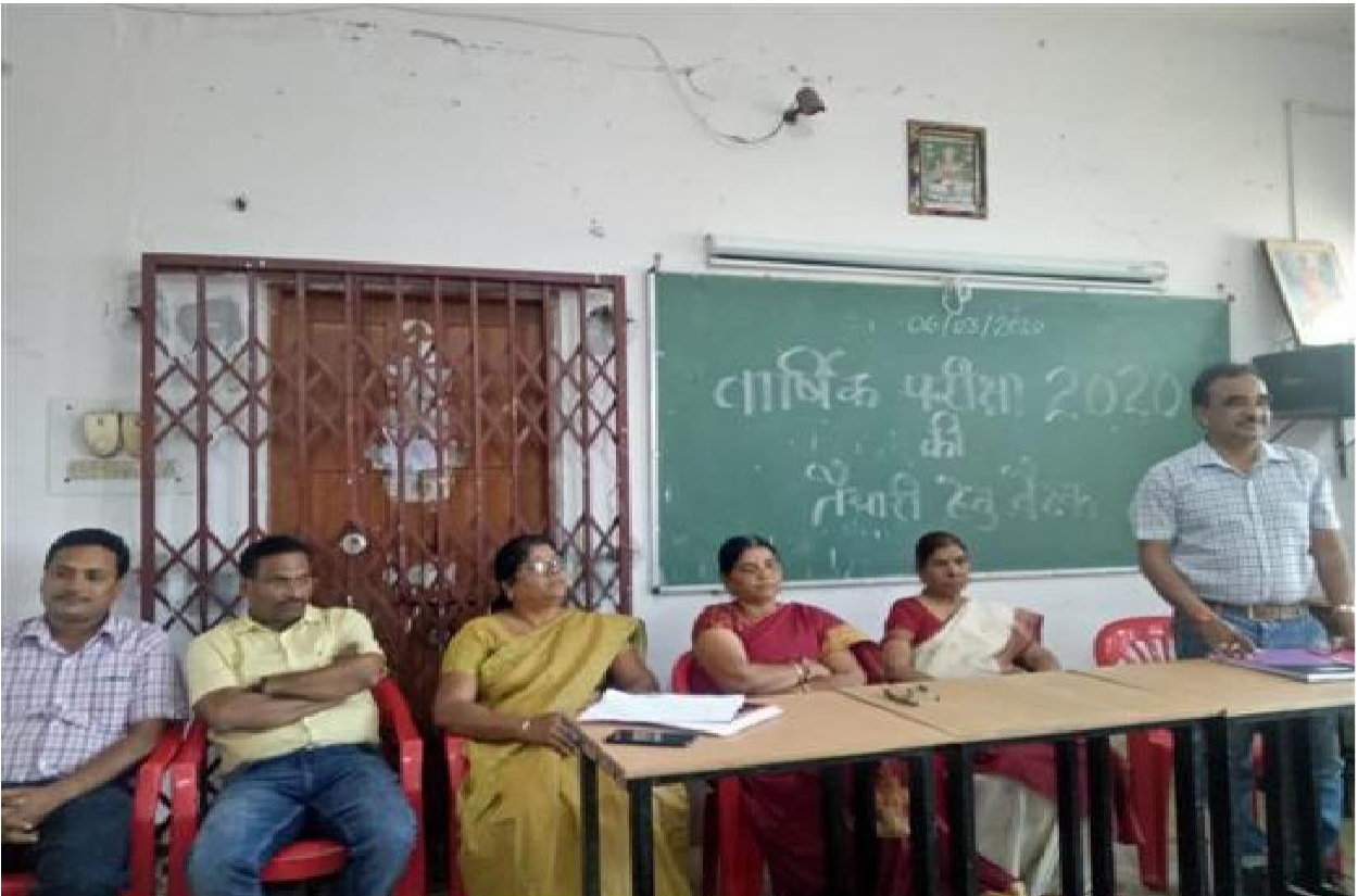
Photo:- Meeting on Preparation of IQAC national seminar, Below-Meeting of Exam. Committee.