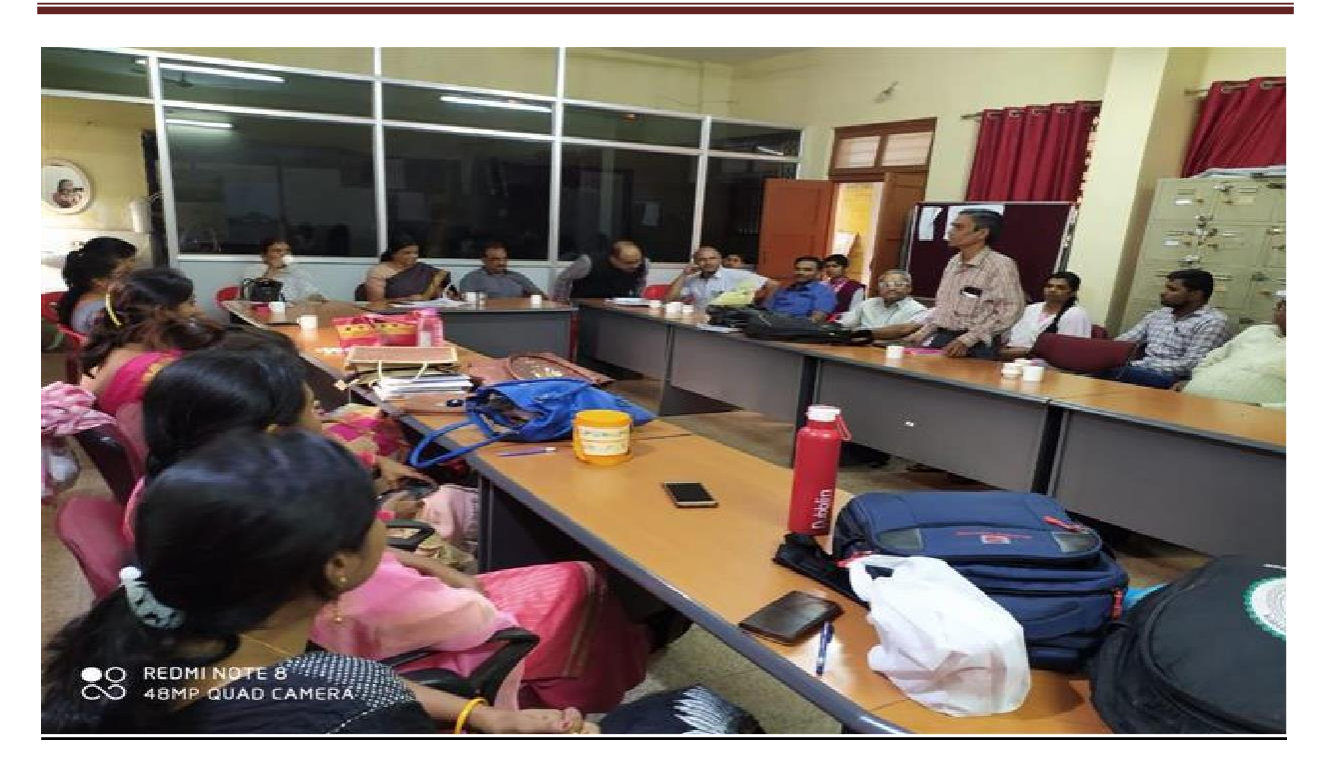
6.5.2-The institution reviews its teaching learning process, structures & methodologies of operations and learning outcomes at periodic intervals through IQAC set up as per norms and recorded the incremental improvement in various activities