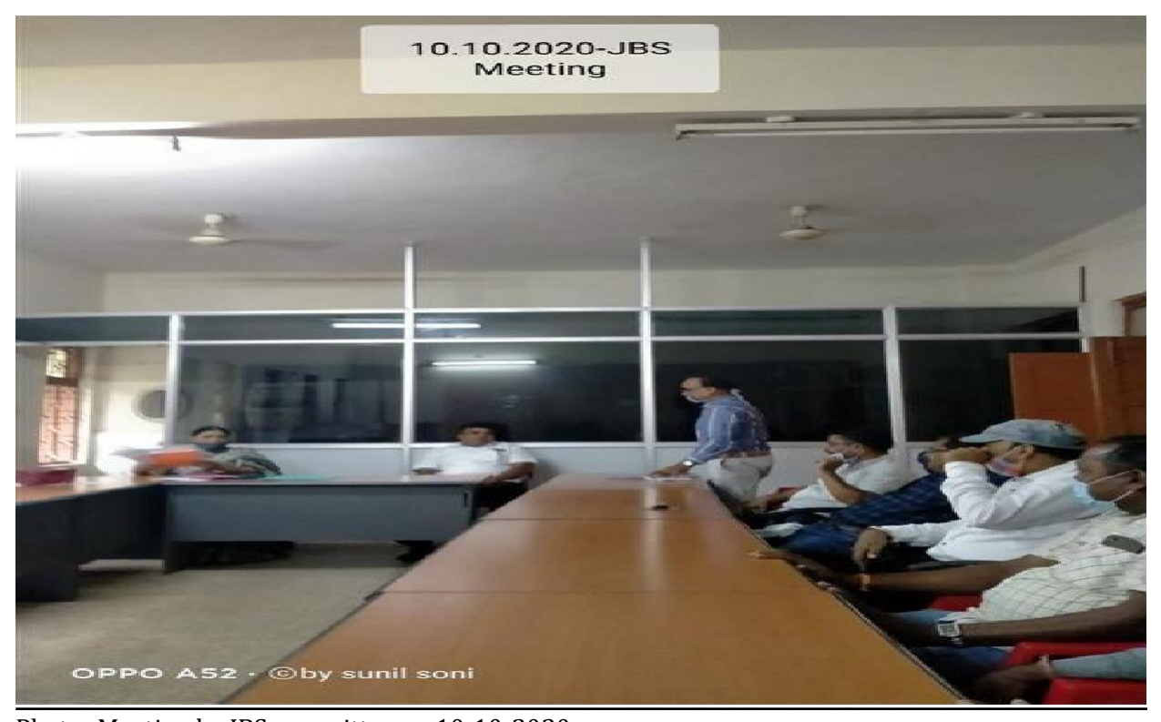
6.5.2-The institution reviews its teaching learning process, structures & methodologies of operations and learning outcomes at periodic intervals through IQAC set up as per norms and recorded the incremental improvement in various activities

Photo- Meeting by JBS committee on 10-10-2020