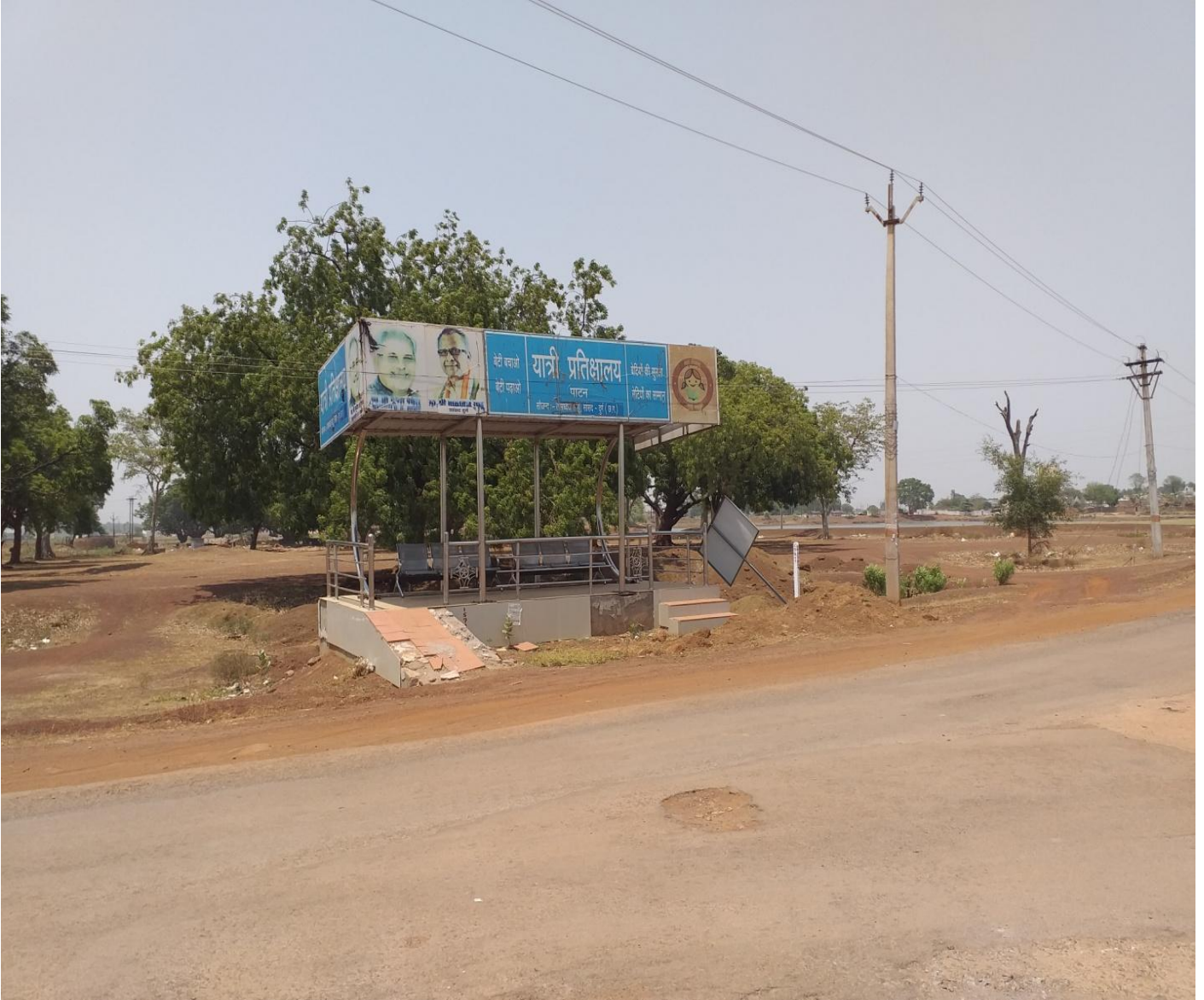
Bus stand is made in front of college, where the syudents wait for their suitable bus.