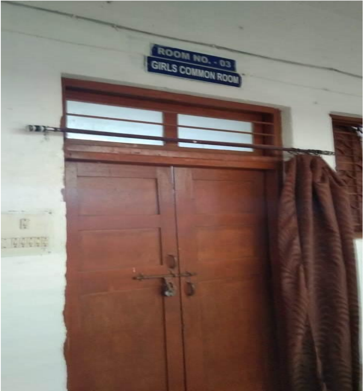
Girls common room is completely secure, and no boys allowed to enter here.