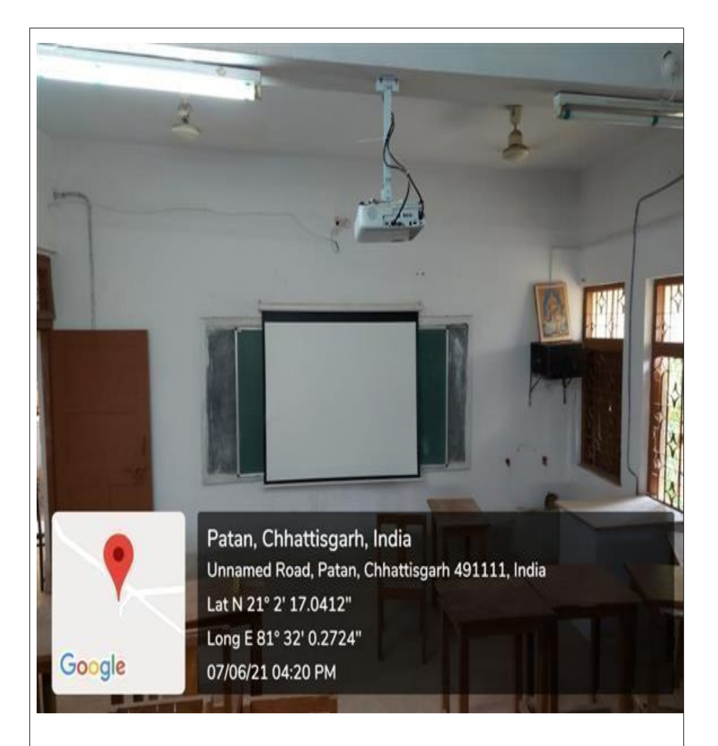
B.Com-I Classroom Projector and Smart Board