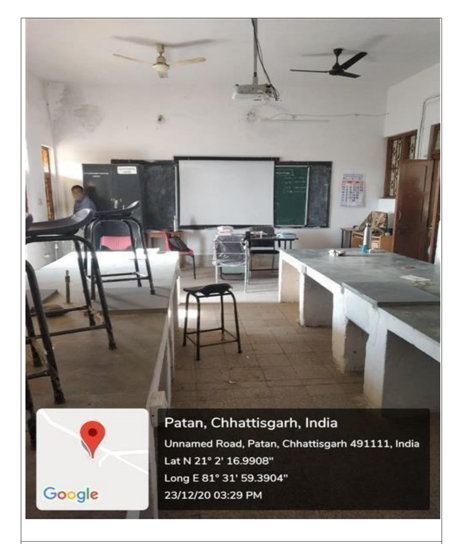
M.Sc.-I semester Chemistry Classroom Projector and Smart Board