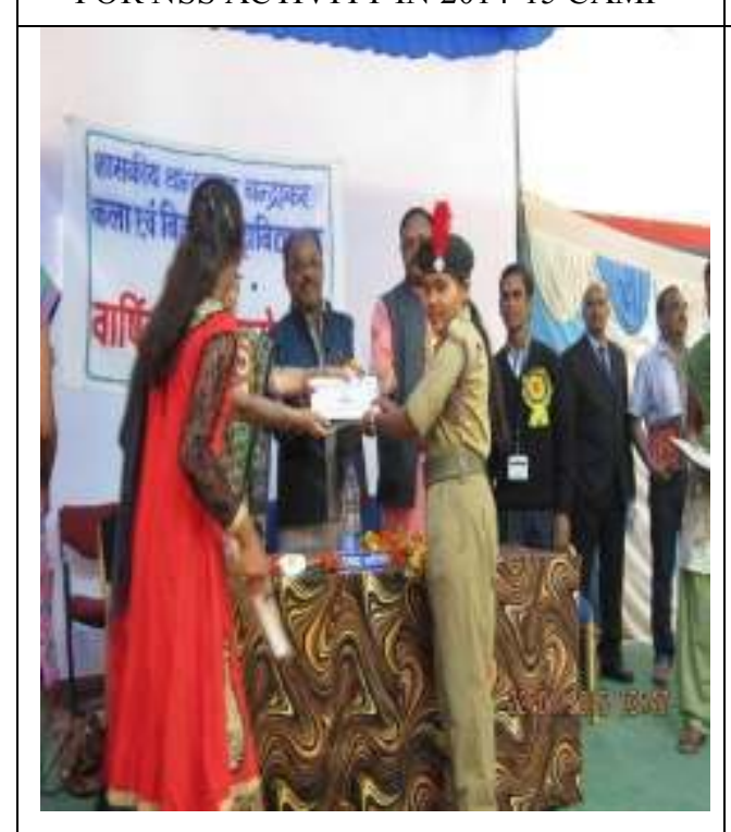
BEST NCC CADET CERTIFICADET AWARDED BY GUESTS