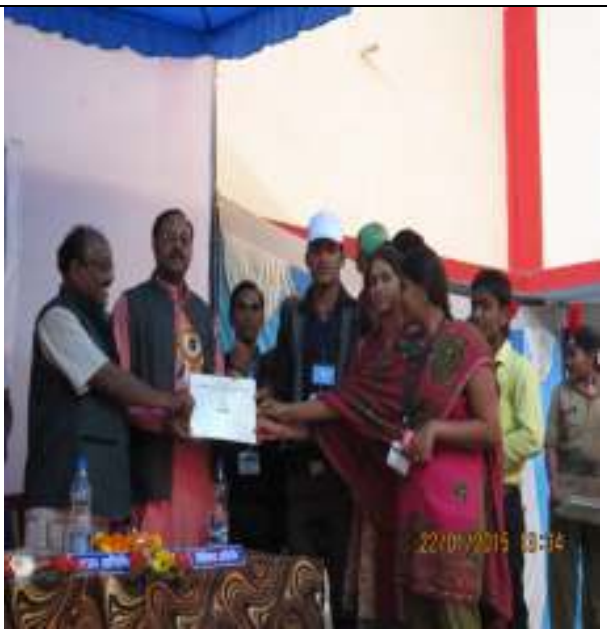
RED-CROSS STUDENT RECEIVING THEIR CERTIFICATES FROM GUESTS