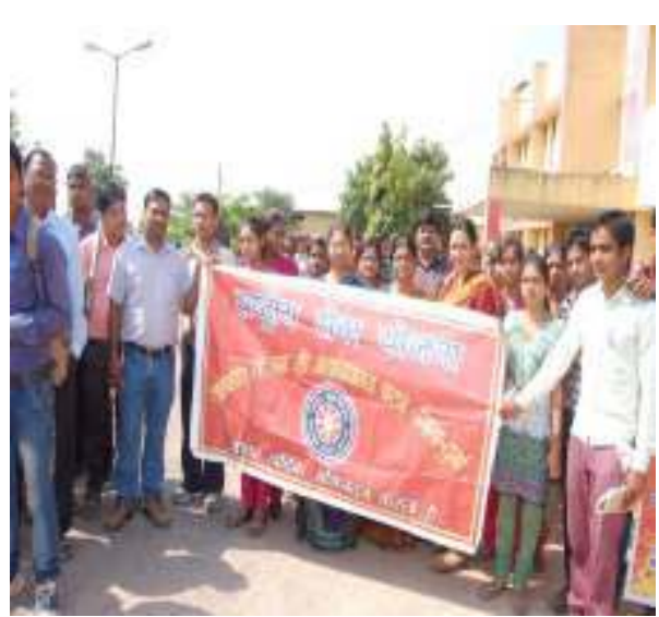
NSS RALLY IS BEING ORGANIZED UNDER REGULAR ACTIVITY